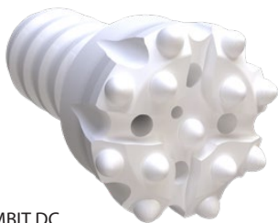
TH MBIT DC

All Robit® Mbits equipped with proven EXTREME CARBIDE